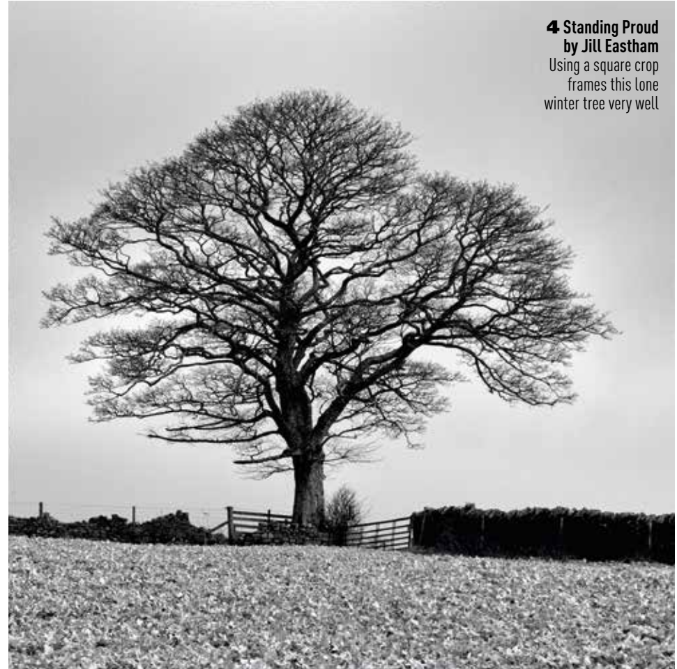
4 Standing Proud by Jill Eastham Using a square crop frames this lone winter tree very well

Want to see your club featured on these pages? Drop us a line for more information at apl@ti-media.com