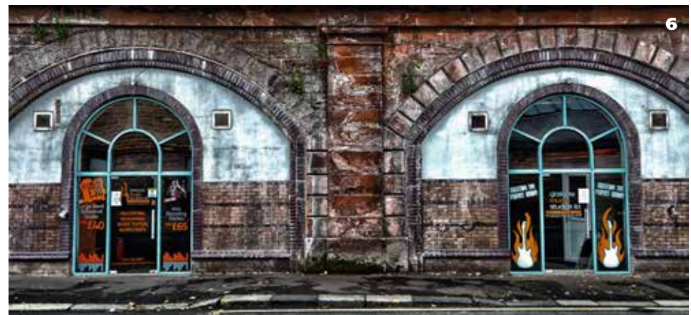
6 Symmetry - Rock n Roll The patterns and shapes created in this shot are very effective and show the character of the building